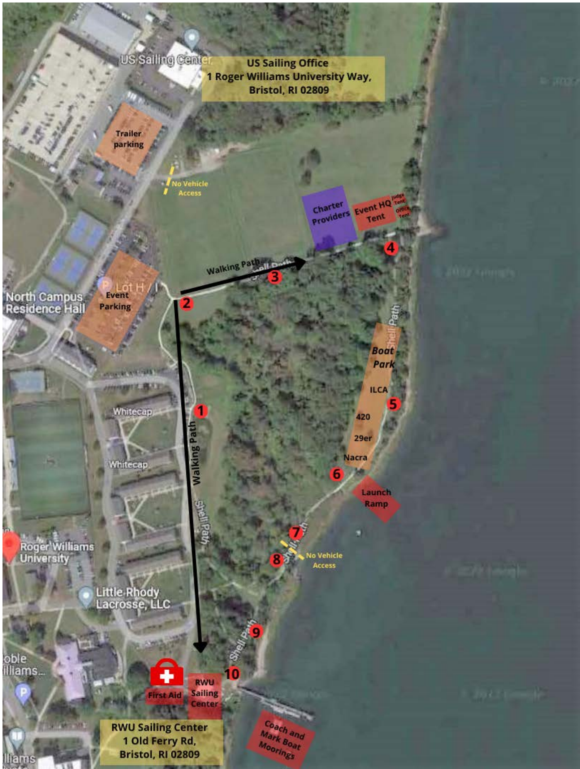
Diagram below for the map of the regatta site on the Roger Williams University Campus.